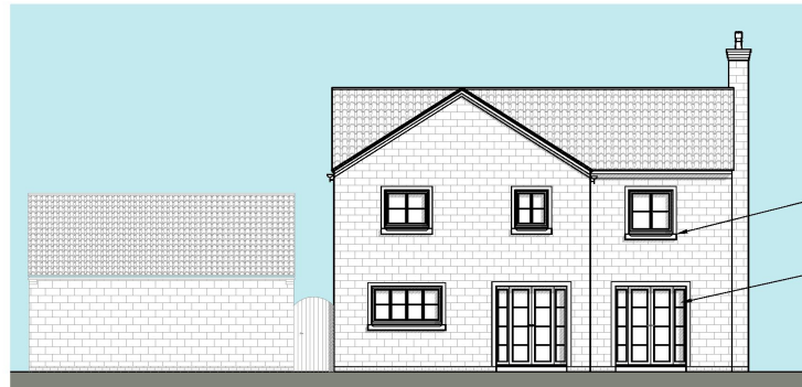
04 PROPOSED REAR ELEVATION (WEST) 1:100