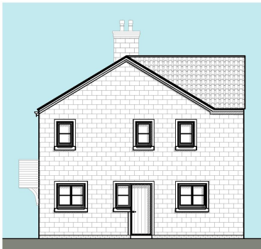
03 PROPOSED SIDE ELEVATION (NORTH) 1:100

First floor side windows to be opaque glazed and fixed closed.